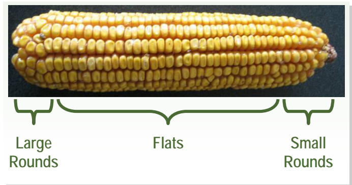
Figure 1. Seed size and shape on a corn ear varies from large rounds (left; cob base), flats, to small rounds (cob tip).

This is the area where seed size and shape does matter. Planter settings should be adjusted for accurate seed positioning,