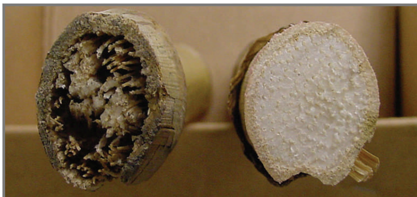
Figure 1. Stalk with fungal rot (left) and a healthy stalk (right).