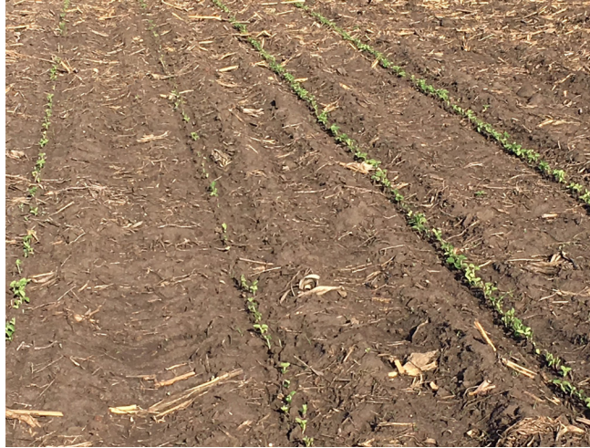
Figure 2. The two rows on the left are untreated, the two rows on the right are treated with Acceleron® Seed Applied Solutions STANDARD.