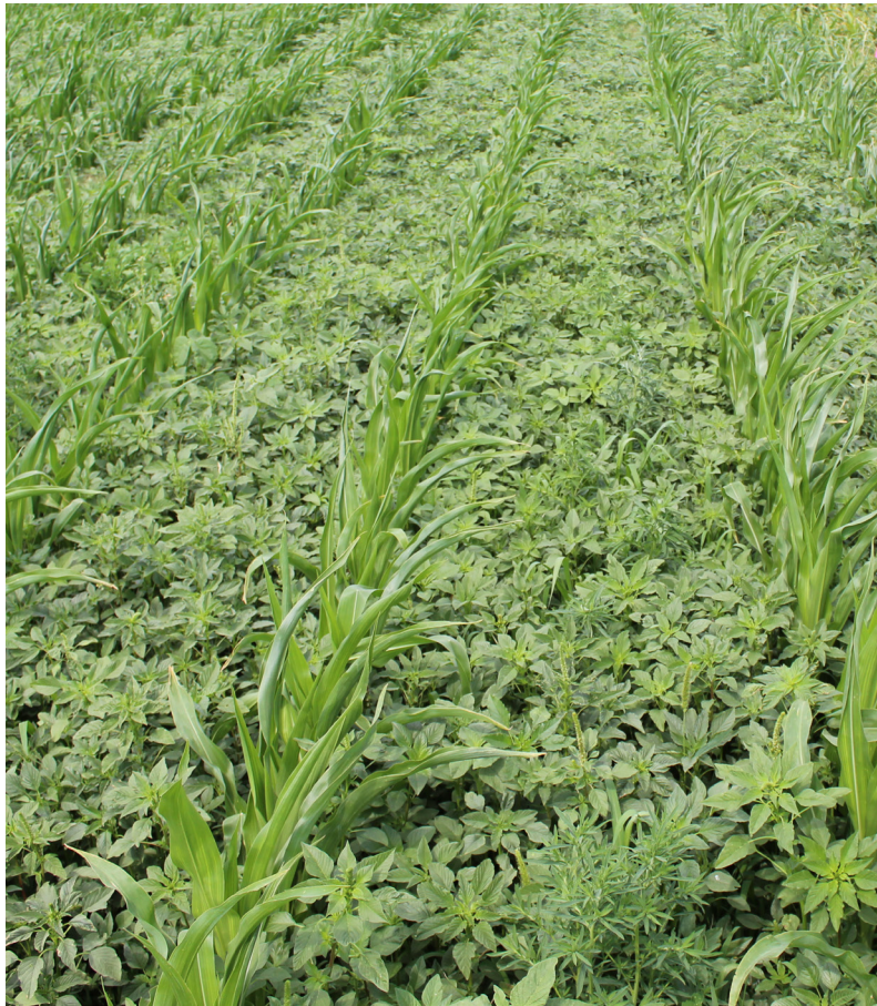
Figure 1. Non-treated plot containing Palmer amaranth and kochia.