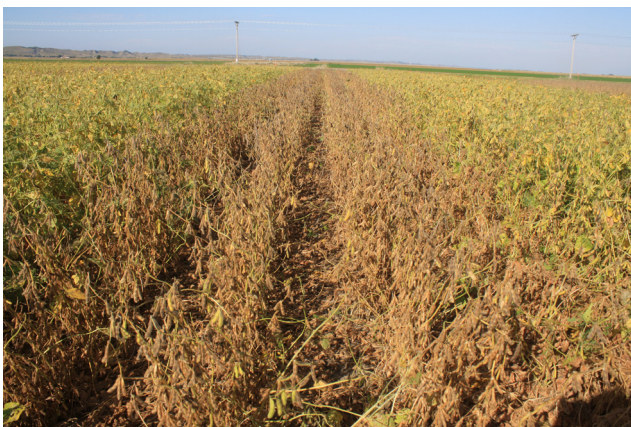
Figure 2. Image of the 2.0MG product in the +Boron fertigation treatment.